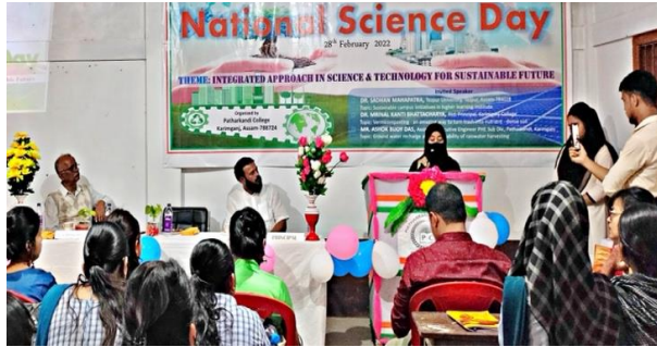
Speech on theme by Student