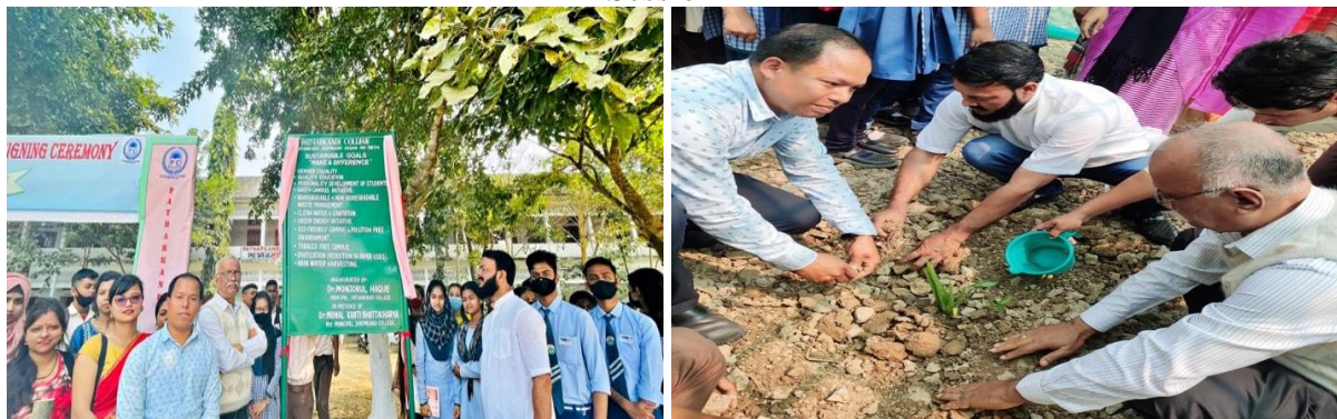
Inauguration of College Sustainable Goal and Green house & Vermicompost Unit